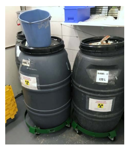
Photo 8: Liquid effluent collection drums in Zone 3 with new labels posted after inspection

The liquid effluent collection drums in the tritium laboratory area and the LLW drum in the waste storage area in Zone 3 were adequately labelled in accordance with subsection 20 (1) of the Radiation Protection Regulations .