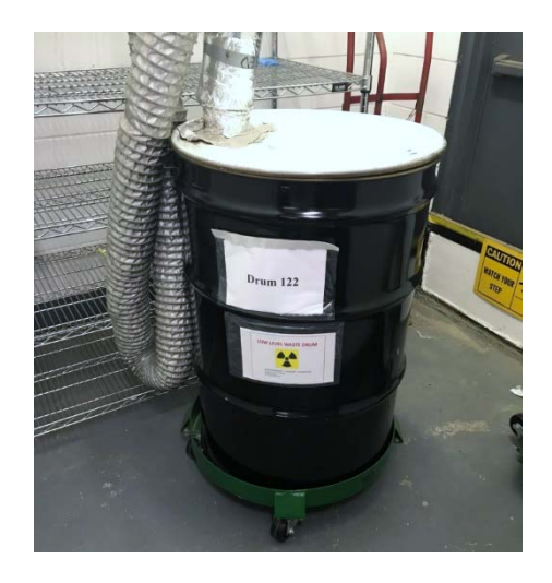
Photo 10: New label on LLW drum in waste storage area posted after inspection