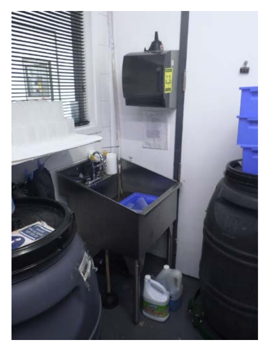
Photo 1: Obstructed eye wash station in the tritium laboratory area