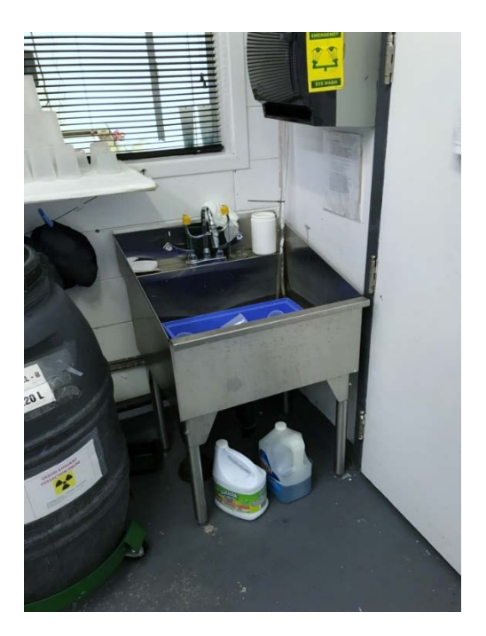
Photo 2: Eye wash station in the tritium laboratory area cleared of obstructions

In the tritium laboratory area in Zone 3, CNSC staff observed an eye wash station that was obstructed by several items (liquid effluent barrels and liquid containers) as shown in Photo 1. It is evident that this eye wash station is not readily accessible for immediate use by employees, which does not confirm with subsection 16.8 (1) of the Occupational Health and Safety Regulations .